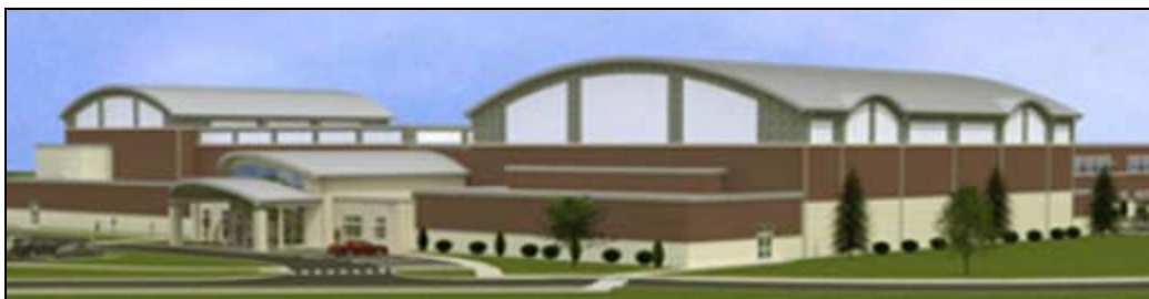
Figure 3: Exterior View