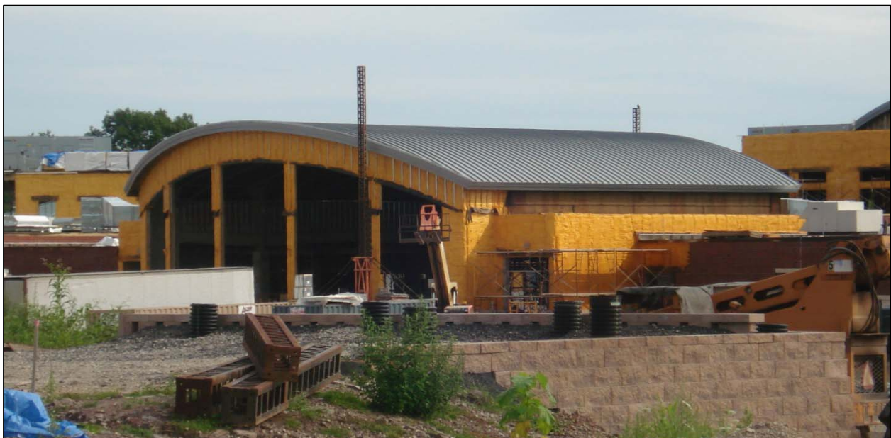
Figure 2: Exterior Insulation